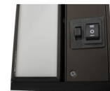
On/Off Switch with 100%/50% Dimming Color Temp. Switch: 2700K/3000K/4000K