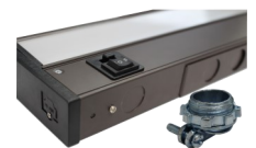
1/2" KOs Cable Connector Included