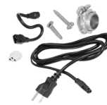
6' Power Cord 8' interconnect cable End-to-End connector Mounting screws