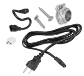
6' Power Cord 8' interconnect cable End-to-End connector Mounting screws